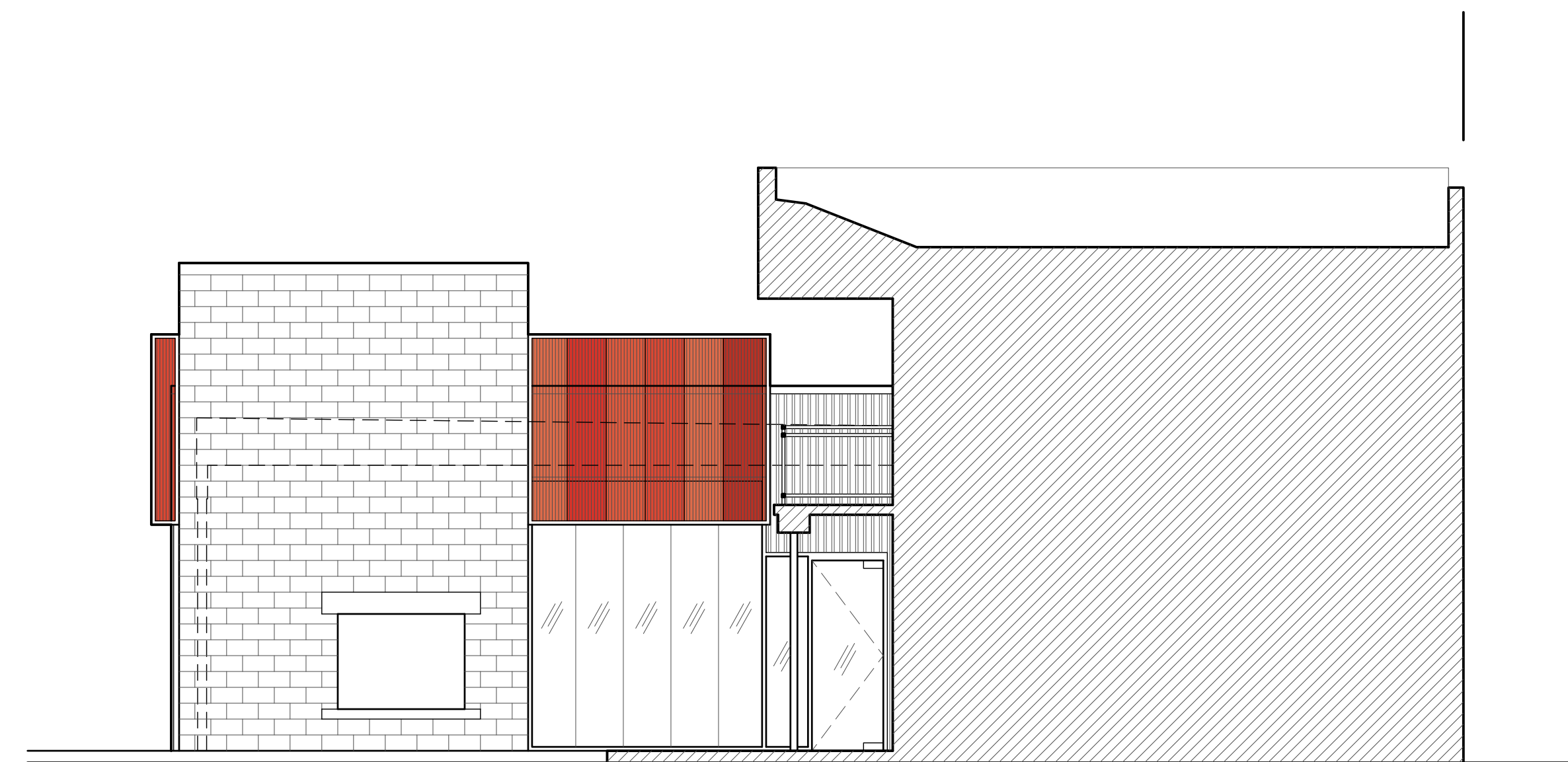
lobby building - north elevation